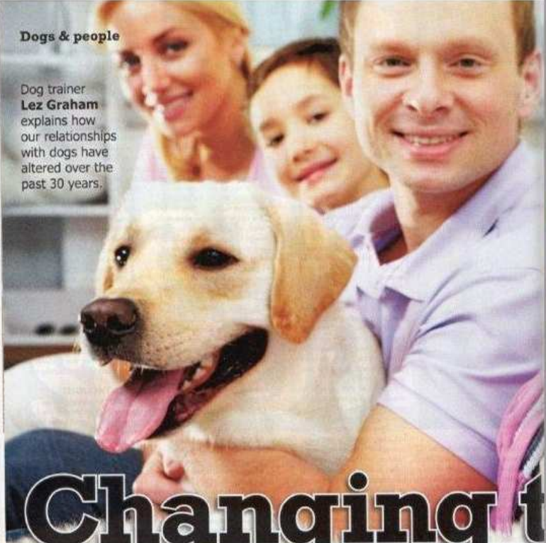
Family life, and how we interact with dogs, has changed significantly over the past 30 years.