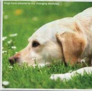
Dogs have adapted to our changing lifestyles.

There's also been a surge of the 'designer' dog, the Labrador, spanner, cockapoo and so on. Much unlike the old Heinz 57 dogs of old, which were generally healthier and hardier, these new mutts are mixes of breeds.